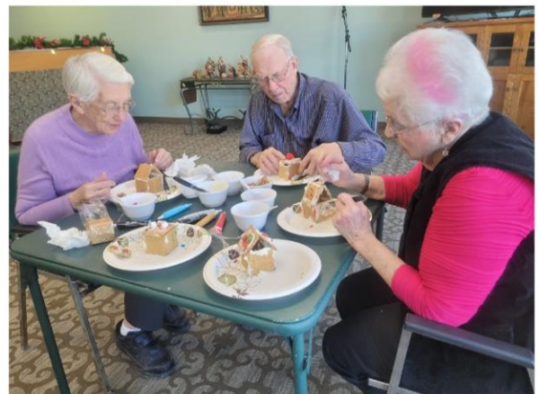
Gingerbread Houses: An outhouse, fishing shack and present.