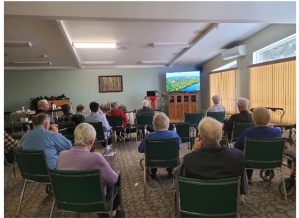
Armchair Travel to Ukraine.