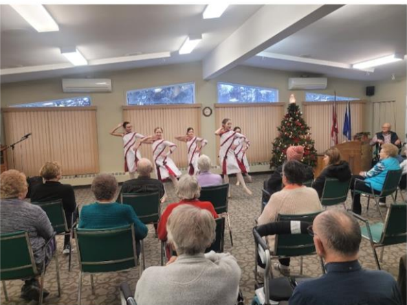
Three Hills Dance Celebrations Xmas Program