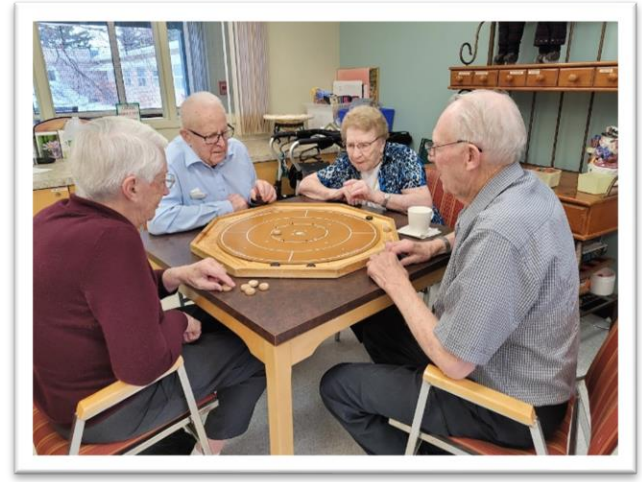
Crokinole and Coffee