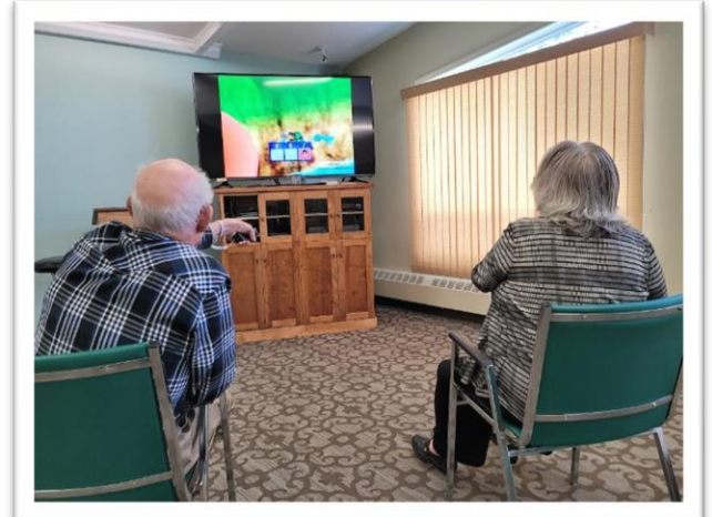
New activities: Wii sword fighting and Bowling