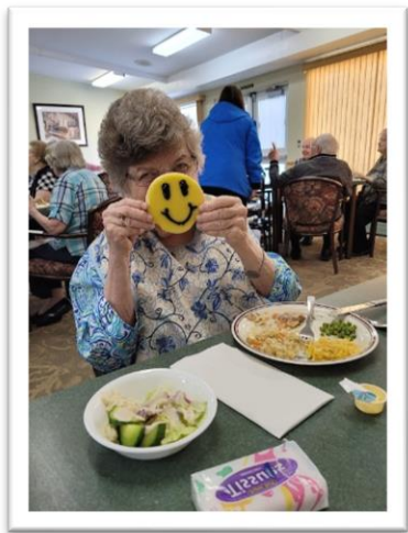
Mental Health Week Smiley Cookies