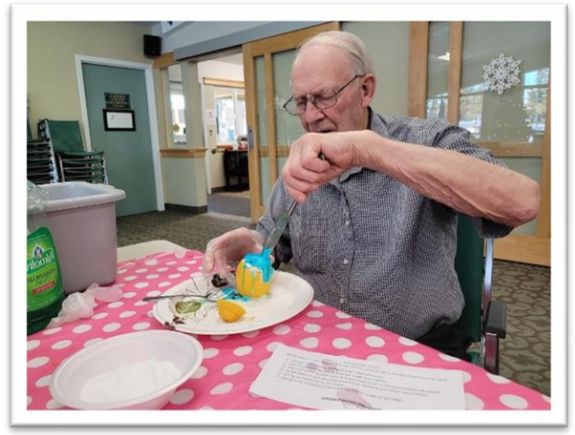
Science Experiments: Exploding Lemons