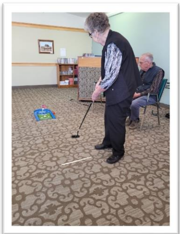
Indoor Mini Golf