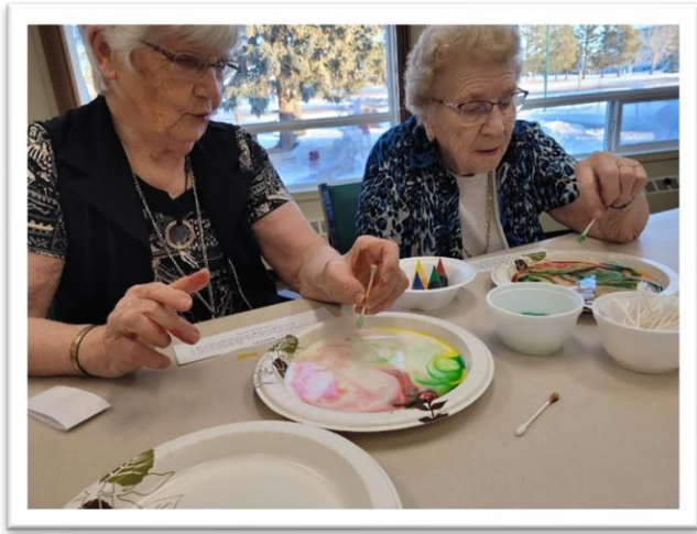
Science Experiments with Milk and Soap