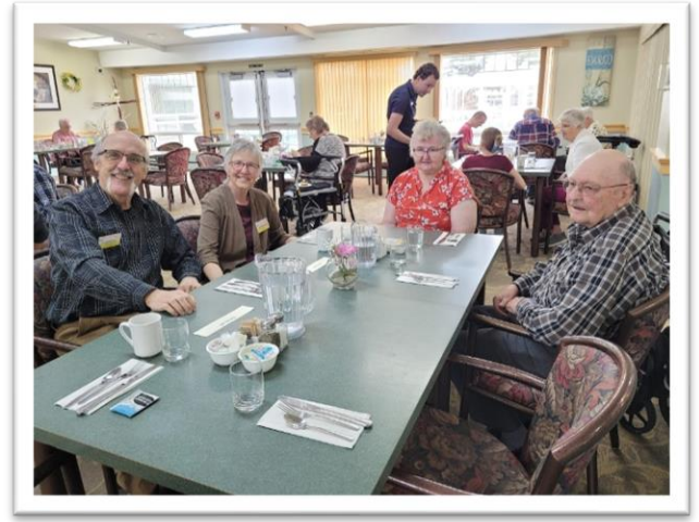
Volunteer Appreciation Lunch