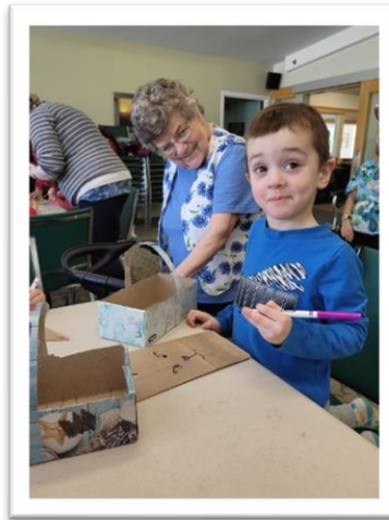
Daycare Easter Egg Hunt