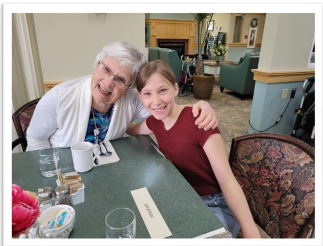
Volunteer Appreciation Lunch