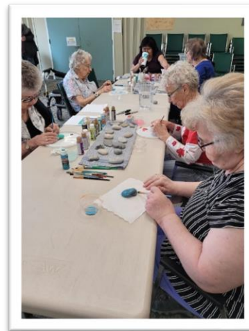
Kindness Rock Garden Project