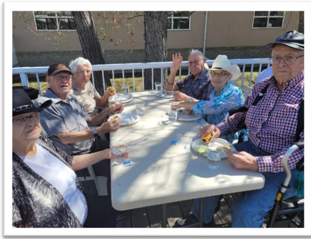
First BBQ of the Season!