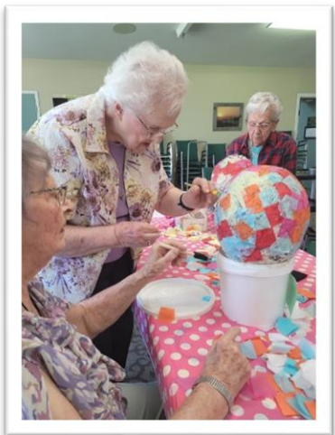
Cinco De Mayo Pinata making